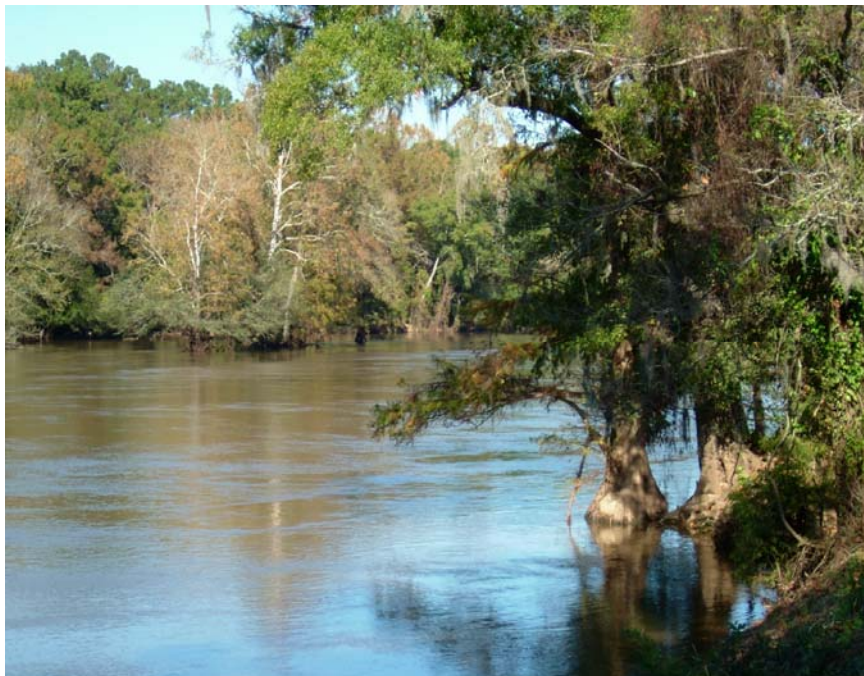
The Flint River

The first weekend in May Camilla hosts "Gnat Days", a yearly tribute to our favorite southern pest. Featuring a 5K race, garden tours, concerts, "Gnat Ball", Tasters Luncheon, and much more, Gnat Days is sure to provide a fabulous time.