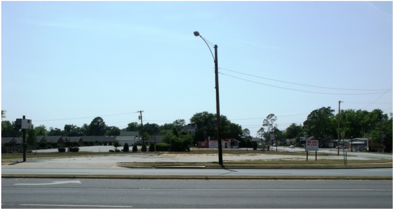
VIEW FROM THE SIDE