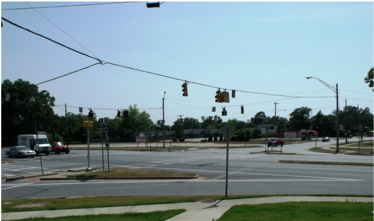
VIEW OF THE ENTIRE INTERSECTION