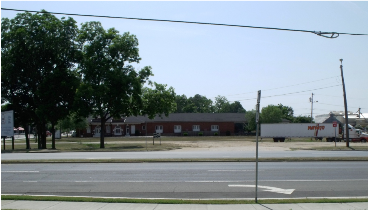
SIDE VIEW FROM HWY 19