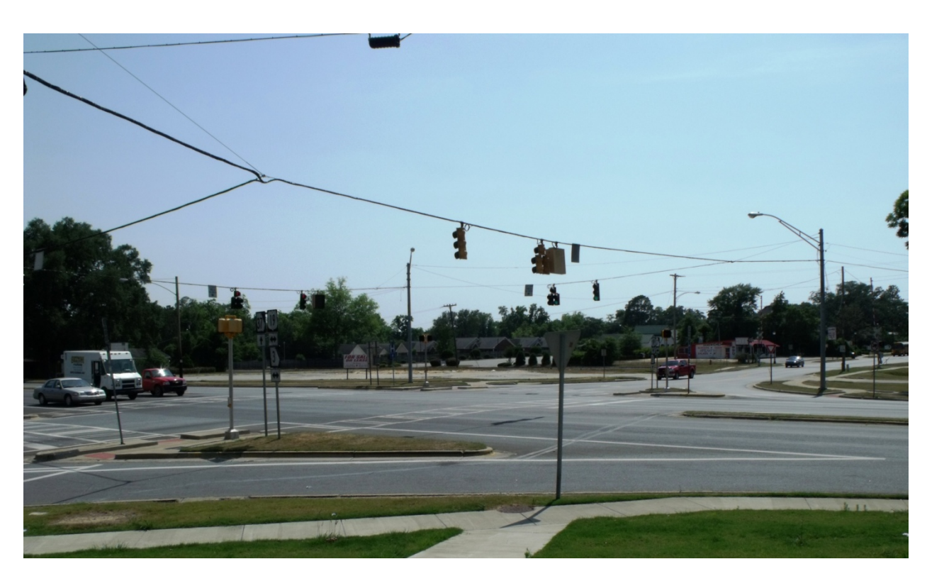
VIEW OF THE ENTIRE INTERSECTION