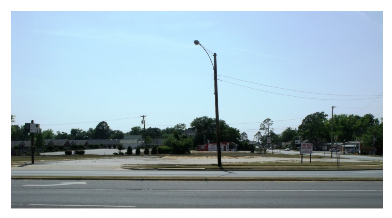
VIEW FROM THE SIDE